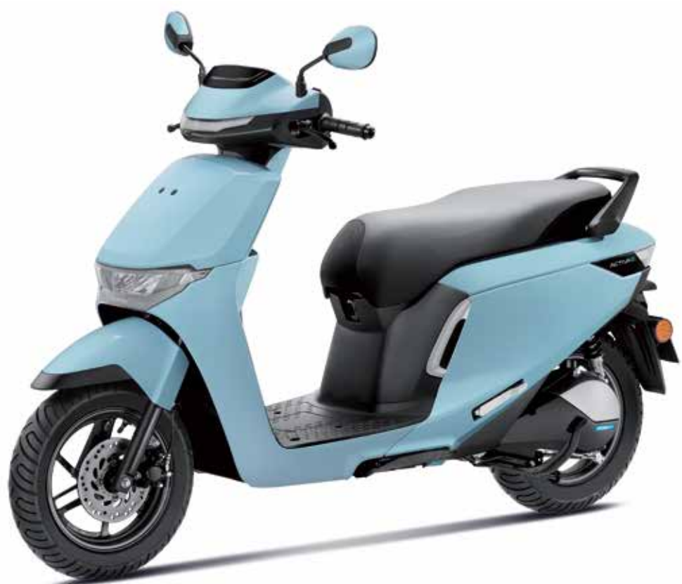
Pearl Shallow Blue

Choose the shade that complements your vibe.