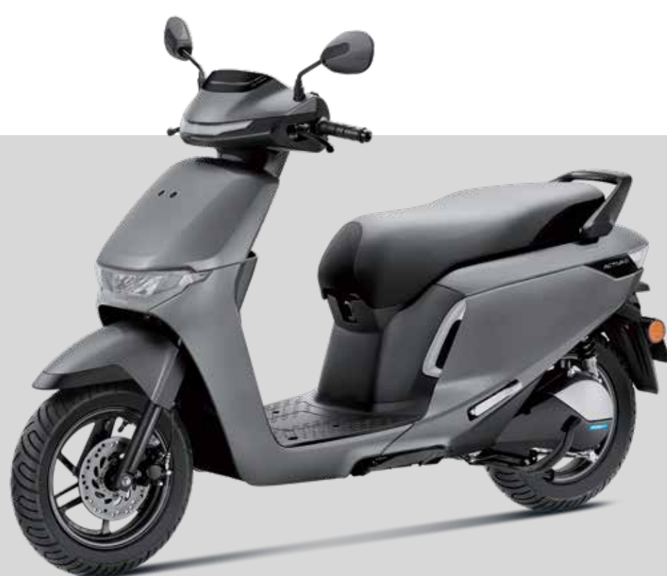
Matt Foggy Silver Metallic