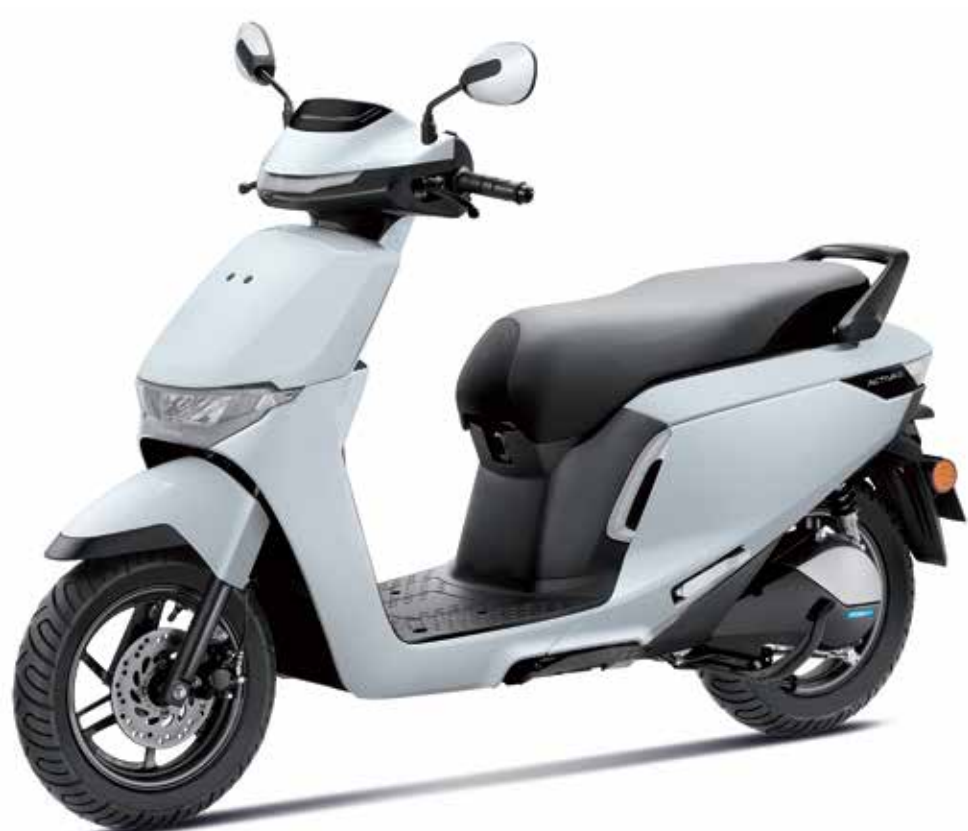
Pearl Misty White

*Products shown in the pictures may vary from actual products available in the market. All features and colours may not be part of all variants. Accessories shown in the pictures are not part of standard equipment. For creative visualisation only.